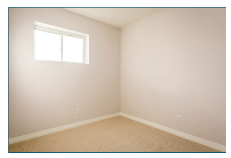
Figure 2 One of two bedrooms with good natural light.

Secondary suites can make homeownership more affordable for first-time homebuyers by offsetting mortgage costs with rental income. In fact, as of September 2015, CMHC considers up to 100 per cent of gross rental income from a two-unit owner-occupied property that is the subject of a loan application submitted for insurance. The annual principal and interest for the property, including the secondary suite, must be used when calculating the debt service ratios.<sup>1</sup>