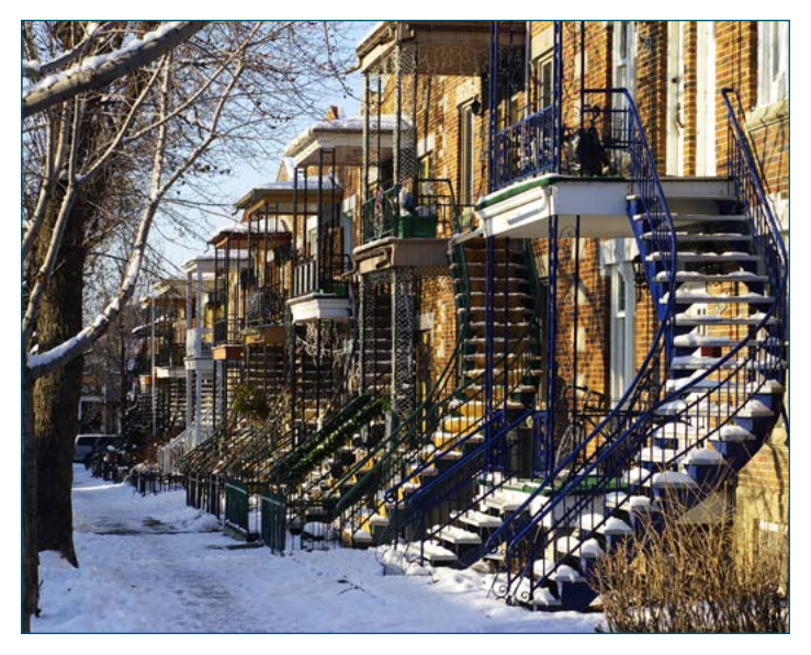
Street scape shows clearly accessibility challenges

"If seniors can see, hear and move independently, they can live in their home. However, progressive loss of independence because of chronic illness or the effects of some diseases result in seniors facing a certain number of difficulties living in healthy living environments that are adapted to their needs. It is with this in mind that we have begun thinking about visiting seniors and evaluating their homes to see if there aren't small things we can do to assist them," explains Cadieux.