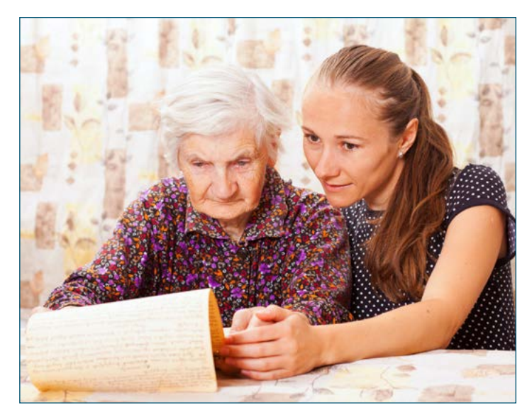
Helping an senior with a task at home

The Centre's team also does prevention by informing seniors about which activities they should perform carefully or those they should no longer perform at all, depending on their condition. "Using a stepladder to change a light bulb when you're 90 years old is a pretty dangerous thing to do," warns Cadieux.