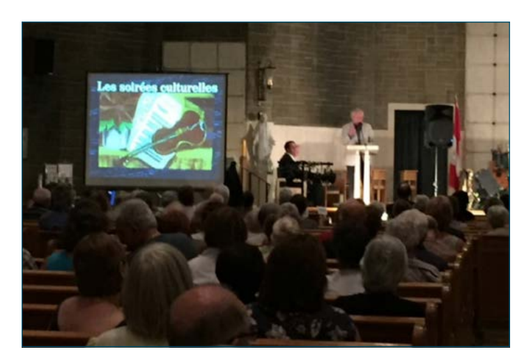
The start of a free summer concert

The Centre de Santé des Aînés Sud-Ouest Verdun is also employing another innovative initiative to target seniors that might need the Centre's assistance. The organization is building partnerships with representatives of places of worship to be notified about people who might need their help.